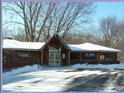
“Michigan Wildlife” DeGraaf Nature Center

Hope everyone is staying warm and healthy this winter season. We look forward to seeing you at these fun and exciting events!