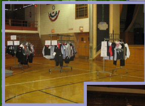
Dutch Costume Resale